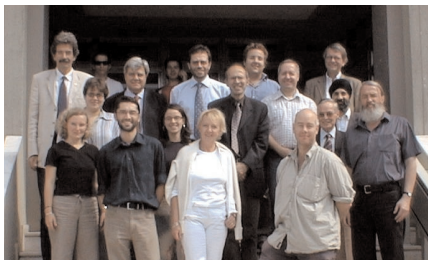
The AIR4EU team in Thessaloniki

The research in AIR4EU is performed by scientists from the University of Stuttgart, the University of Thessaloniki, the University of Hertfordshire and the University of Aveiro. In addition, researchers from the Norwegian Institute for Air Quality Research (NILU) and the Netherlands Research Organisation (TNO) are involved. Finally, Heich Consult provides support to the management and dissemination of the results of AIR4EU.